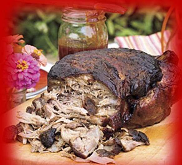
Smoked Boston Butt